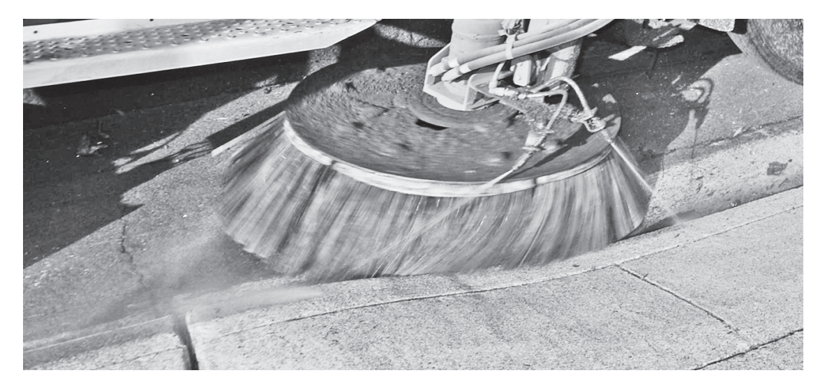
THANK YOU FOR DOING YOUR PART TO KEEP OUR STREETS CLEAN AND TO PROTECT OUR CREEKS AND BAY YEAR ROUND!