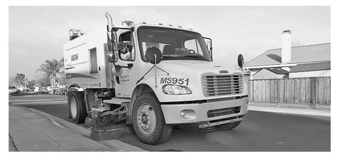
THANK YOU FOR DOING YOUR PART TO KEEP OUR STREETS CLEAN AND TO PROTECT OUR CREEKS AND BAY YEAR ROUND!